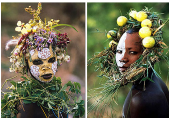
Tribal decoration from Africa