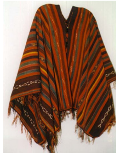
Ikat-decorated poncho from Calcha in Bolivia, south of Potosi